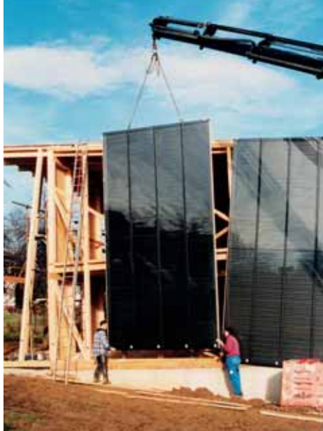
Test facade 1: Two-family home in Graz, Architect: Albert Feldner.

Test facade 1 (DOMA Solartechnik) has already been completed. It has been installed on the south-facade (lightweight construction) of a two-family dwelling at Graz and uses a collector with a special paint coating. The collector covers a gross area of 55 m 2 and relies on low-flow operation with a speed controlled circulation pump in the collector circuit.