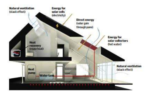
Fig. 2 Hybrid ventilation strategy and energy systems

Chain actuators operate façade and roof windows. Sensors that register temperature, CO_2 and humidity in all rooms and an outside weather station are combined with an intelligent control system. Outdoor weather station collects information also about the wind, rain and solar irradiation.