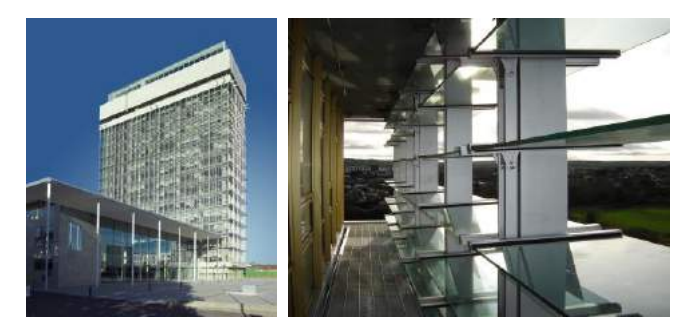
Figure 1: External View of the refurbished building (left) and detail of retrofitted second skin with automated glazed louvres (right)

The Cork County Hall is a 1960's brutalist style office tower in the South of Ireland. One of Irelands tallest buildings, it underwent refurbishment in 2006 with the introduction of an automated double skin façade using glass cladding installed externally to the existing 1960's concrete and window envelope. This provided improved solar protection reducing incident solar radiation and also enhanced the control aspect of the façade enabling night cooling as a strategy as well as removal of heat build-up in summer months. The external louvers incorporated a 'hard' coating to reduce the 'g' value (solar transmission reduced). The external operable glazed louvers protect the natural ventilation openings from wind and rain which allows the windows to be opened in any weather conditions.