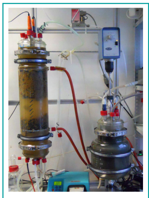
Figure 1. Set up of the biotechnical process

The context of the presented project is the development of a biotechnical process for the generation of a hydrogen-rich biogas from organic residues. By the application of this hydrogen-rich biogas in a stationary gas engine, a decrease of emissions and fuel consumption is expected. A further aim of the project is to discover influencing factors in the fermentation process leading to various hydrogen (H<sub>2</sub>) and methane (CH<sub>4</sub>) yields.